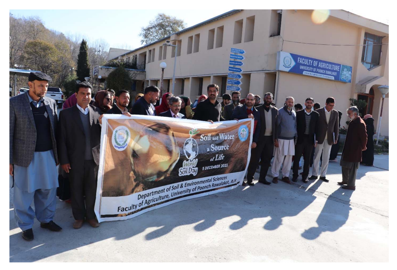
Walk on international Soil Day on December 5, 2023