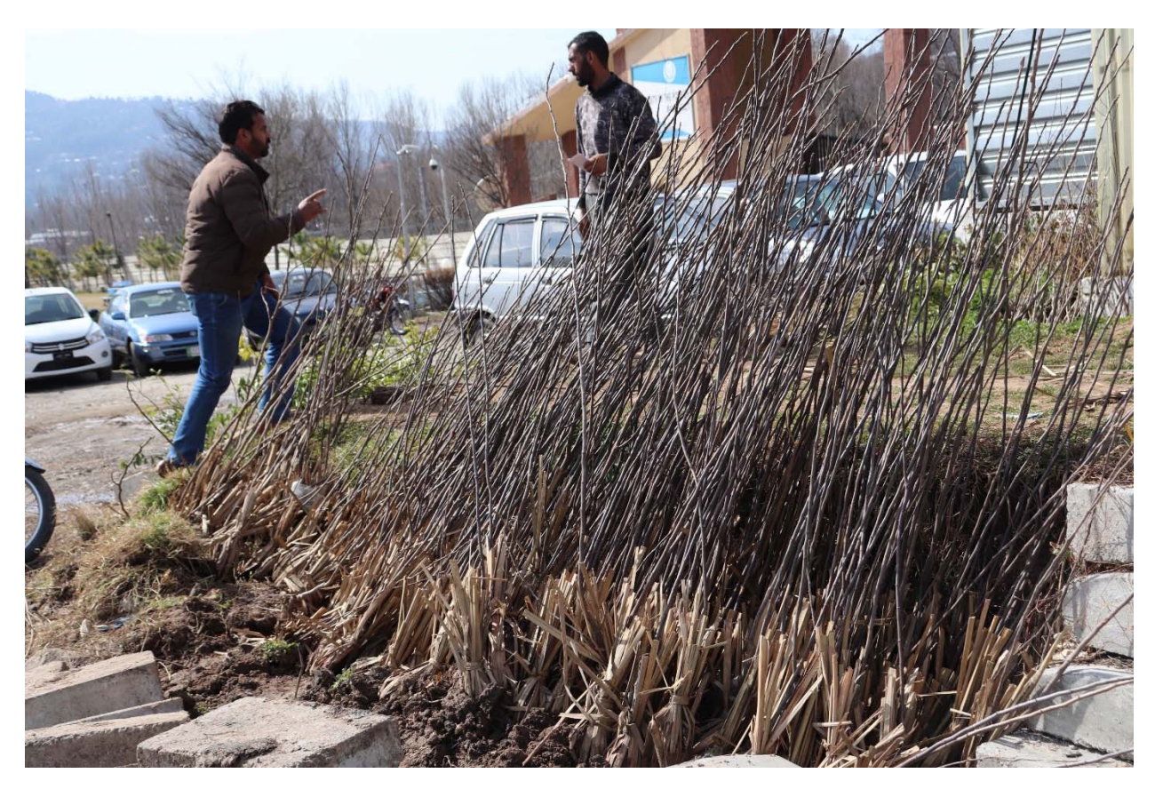
Provision of high-quality trees to community from UPR agriculture farm